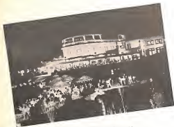
The Casino at Viña del Mar

AS EVERYONE REMEMBERS from geography lessons, Chile is the country which occupies a long thin strip of territory extending from the tropics to the far South, on the Pacific coast of South America. This peculiarity is of great advantage: it affords every variety of soil and climate, and in this respect Chile compares with the United States and its diversified aspects from the Gulf of Mexico to the Canadian border. Northern Chile is tropical. Southern Chile is as frigid as Manhattan.